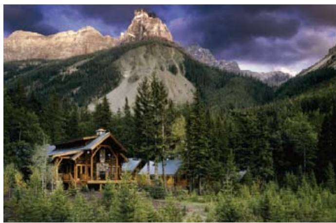
Cathedral Mountain Lodge, Field, BC