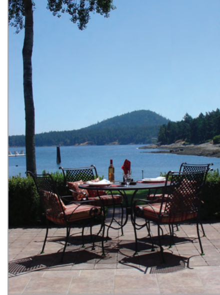
With views of the ocean just steps from your front door, Galiano Oceanfront Inn & Spa is proving so popular some buyers are coming back to purchase a second unit.

Rapidly becoming a serious contender in this competitive world of vacation properties, fractional ownership is on the rise. From Whistler and the Gulf Islands to Osoyoos and the ski slopes of Fernie, many of the most exclusive resorts under construction are adopting this sales model in order to appeal directly to a market that wants a maintenance free, distinctly hands-off approach to recreational property.