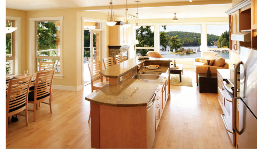
At Painted Boat Resort Spa & Marina kitchens are as luxurious as any downtown condominium, and they come furnished right down to the corkscrew.

Owners have access to their property on a rotational basis – typically for a one-week