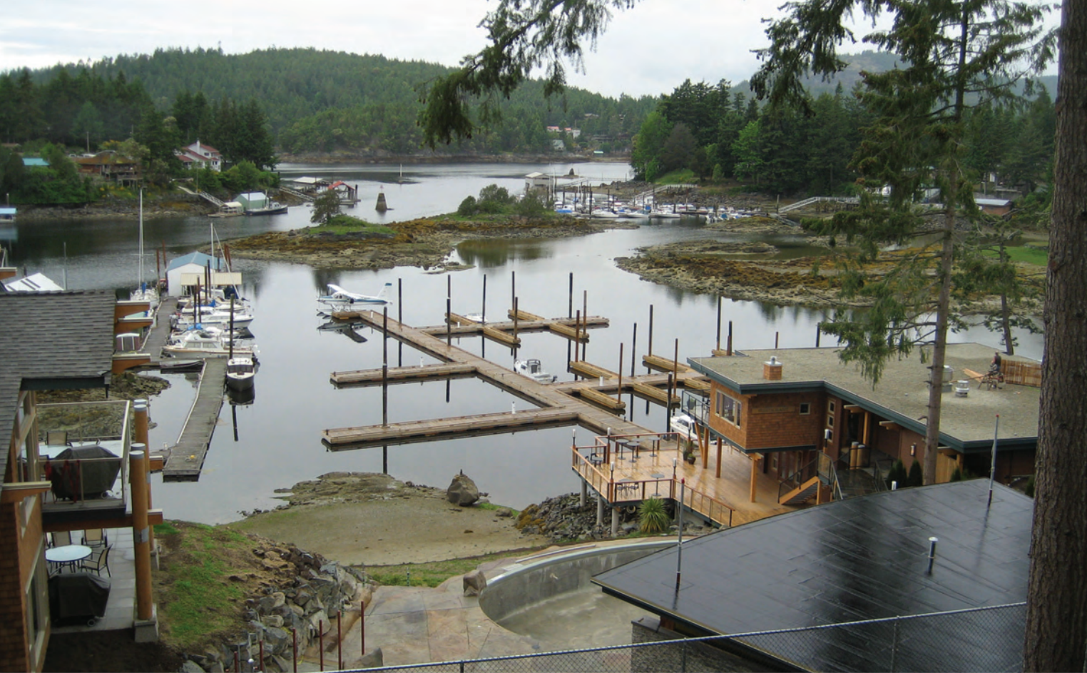
Located overlooking Pender Harbour, Painted Boat Resort Spa & Marina is accessible by road, boat, or floatplane.