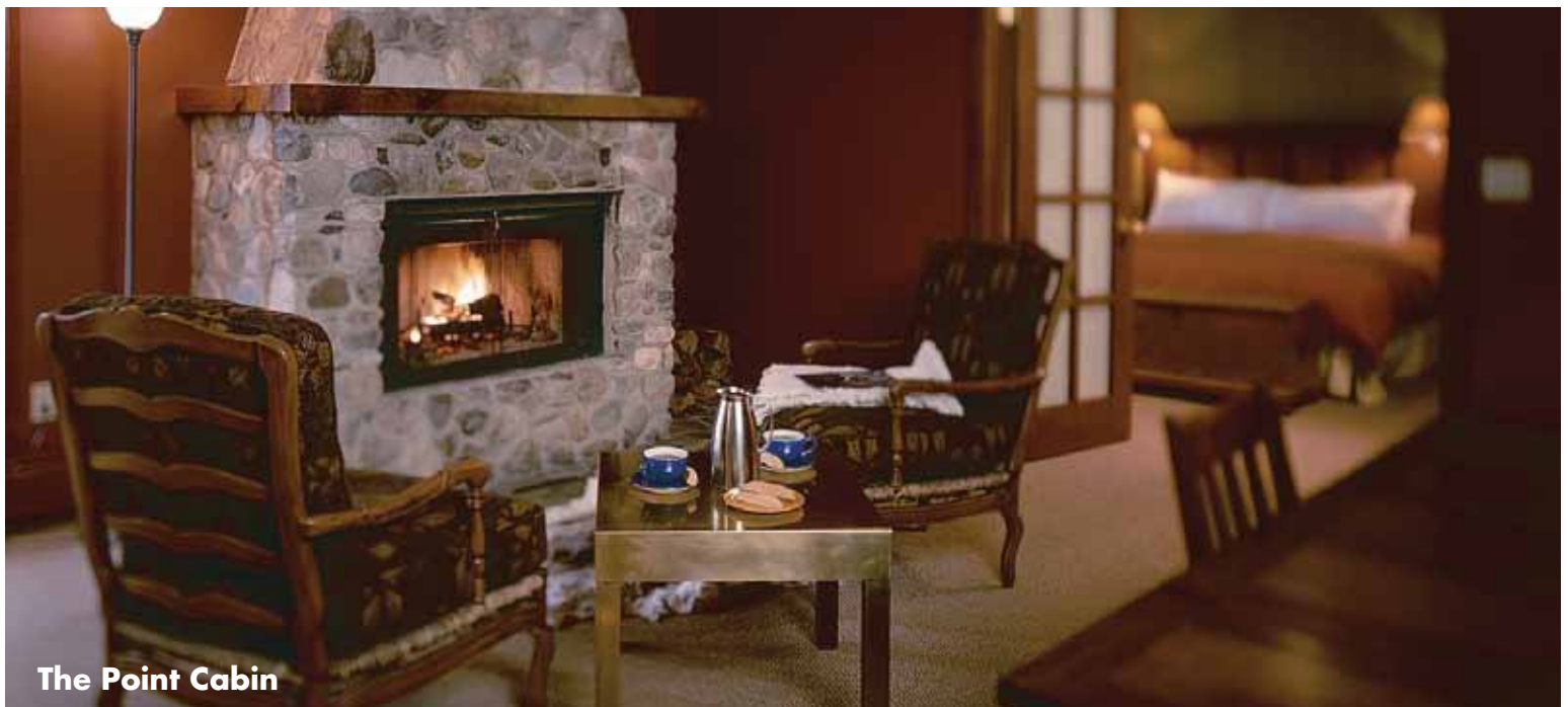
The Point Cabin

The Lodge's most exclusive suite. It has a master bedroom with a King bed, en-suite bathroom with whirlpool bath for two and separate shower. Doors lead to a spacious living area with a double pull out sofa bed, dining area with sink and refrigerator. The living room offers half bathroom and full wrap around balcony with the premier view of Emerald Lake.