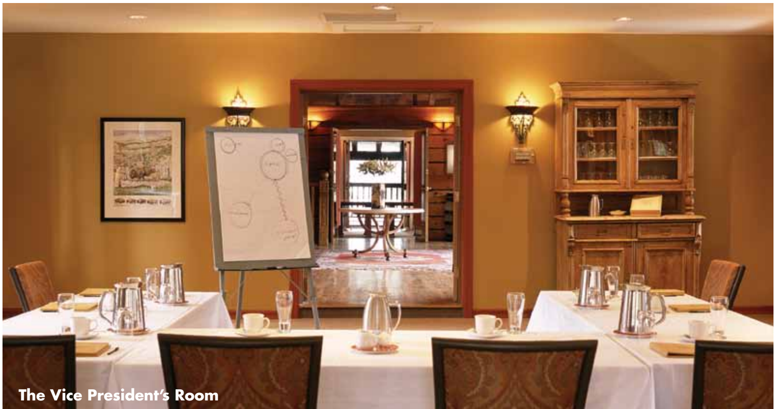
The Vice President's Room