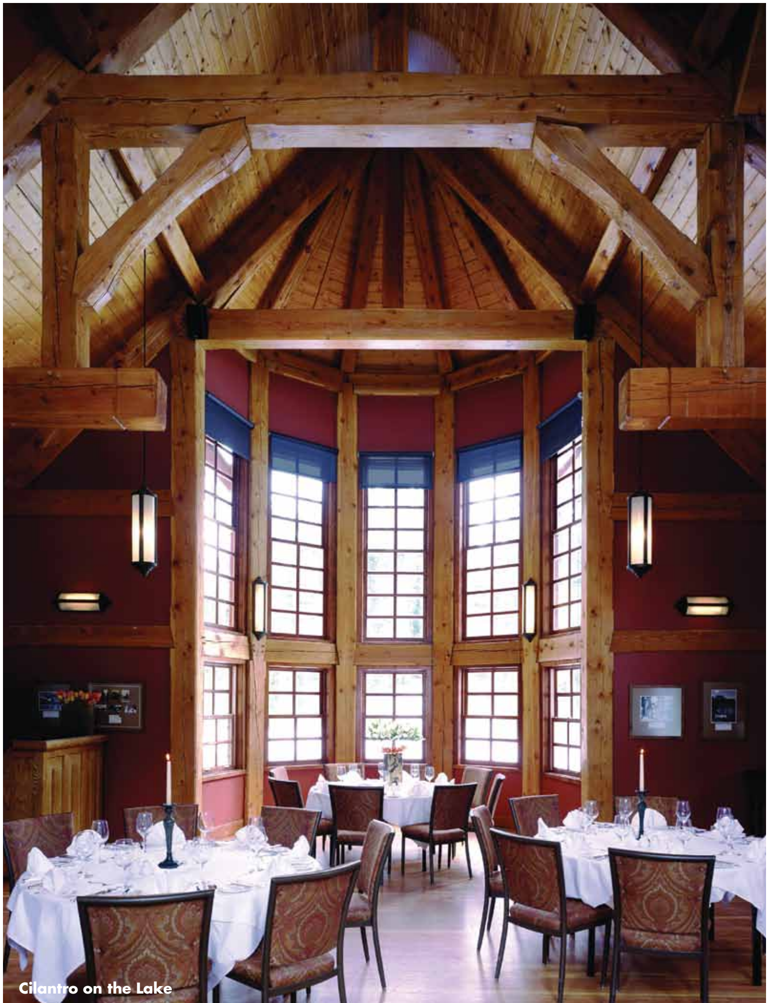
Cilantro on the Lake