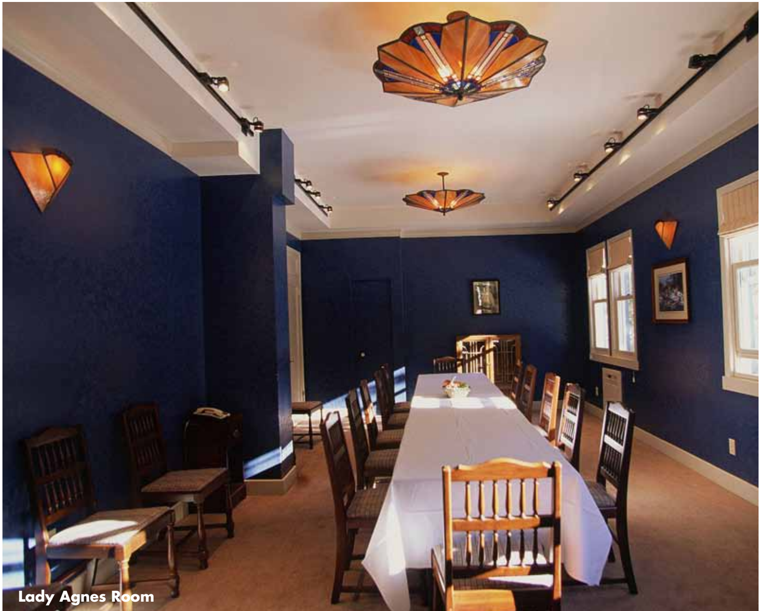
Lady Agnes Room