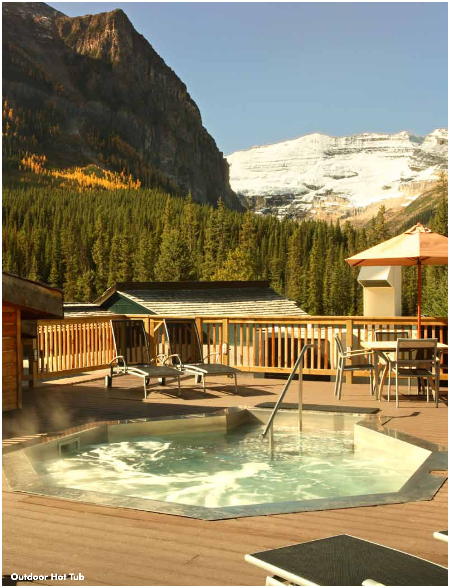
Outdoor Hot Tub