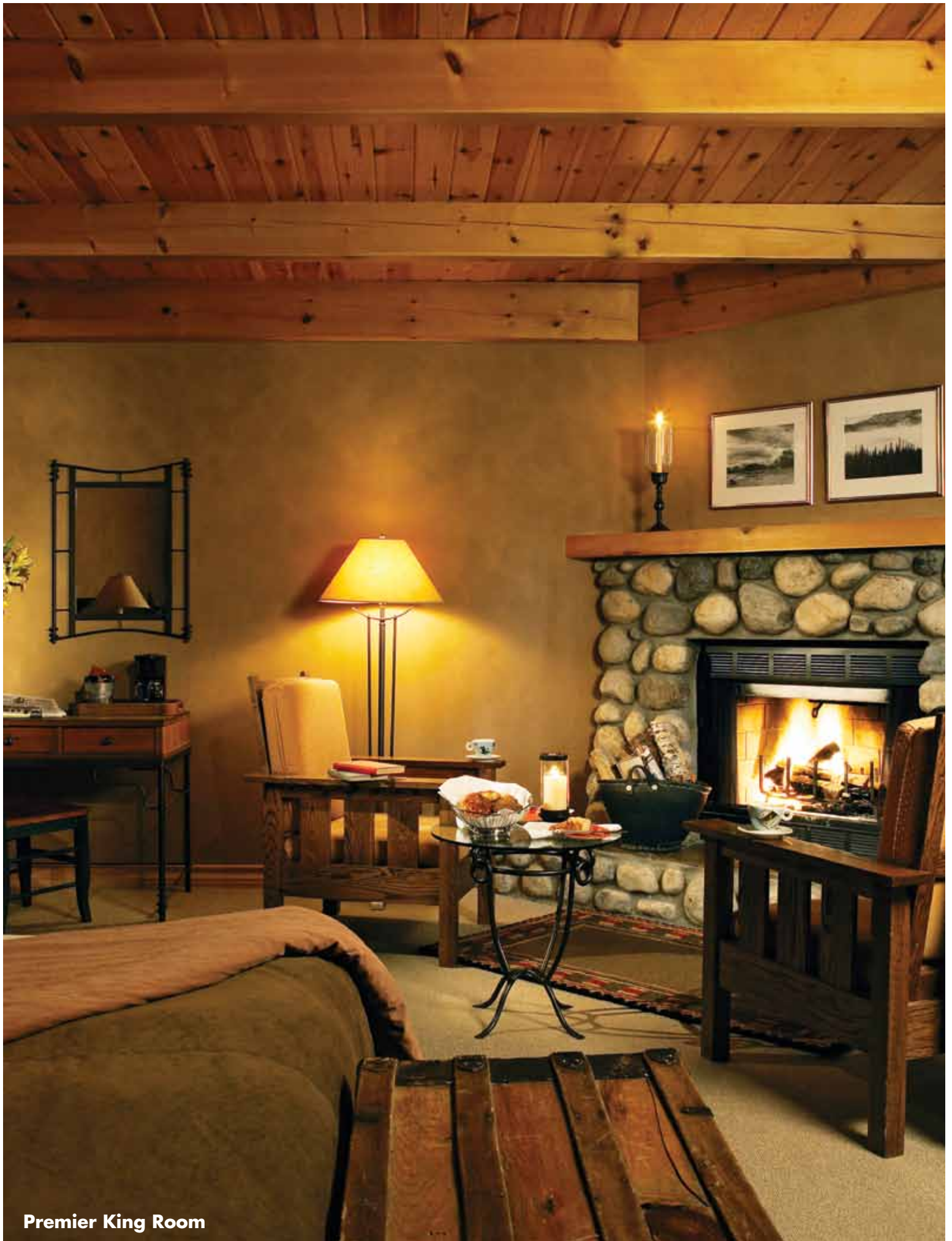
Premier King Room